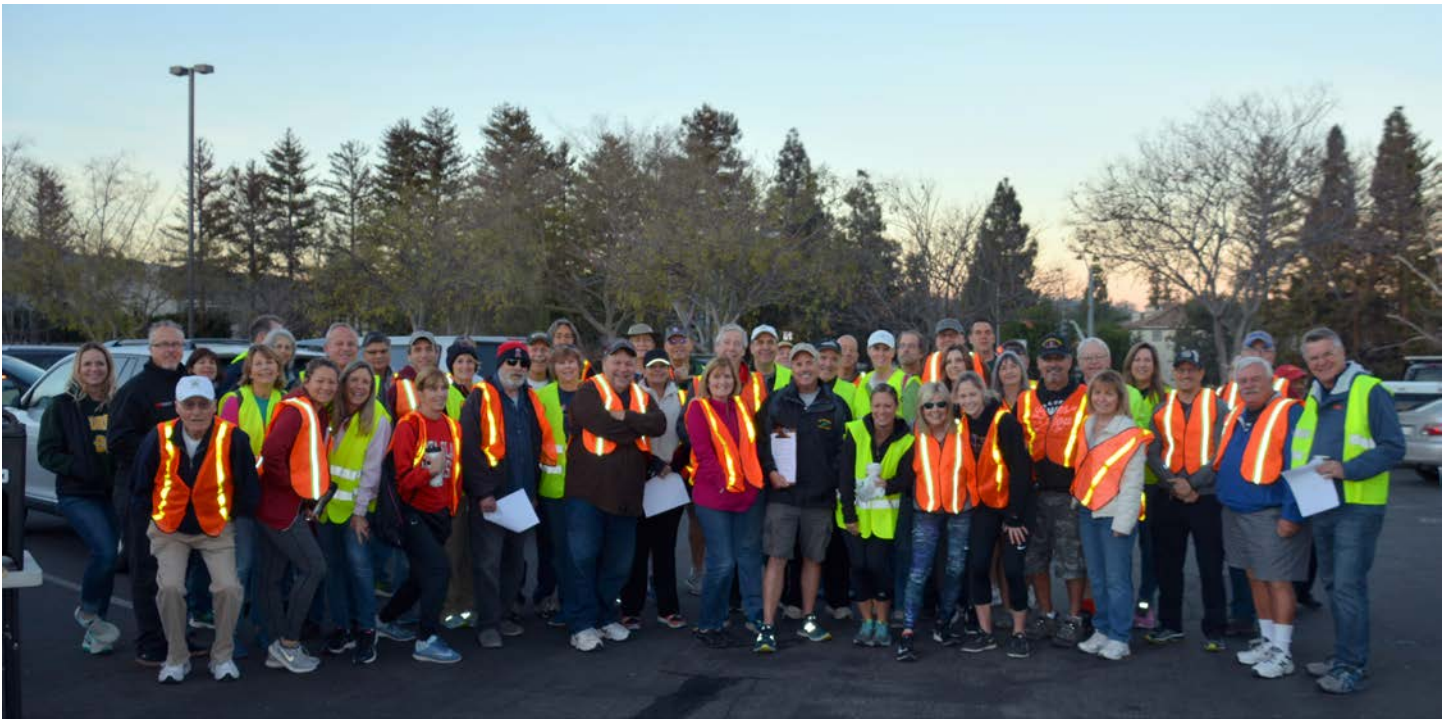
MPC makes a proud showing of enthusiastic volunteers at the Moorpark High School Groundhog Day 5/10K Run, February 2, 2018. The run raised funding for Moorpark High School's Track and Field team. Look like fun? Contact Marty Rouse and he'll call you next year!